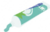
Dental Care Supplies