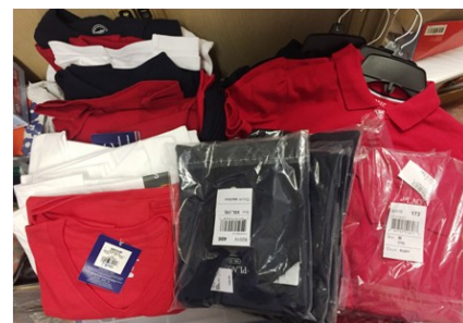
This year we also collected uniforms as part of our school supply list for the children.