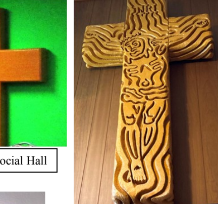
Cross in the Sacristy