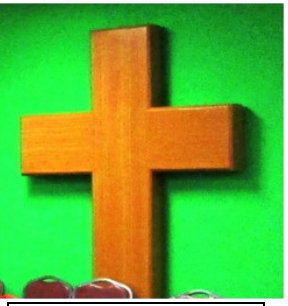
Cross in the Social Hall