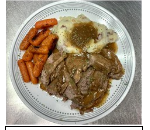
Open Faced Pot Roast Sandwich with mashed potatoes and glazed carrots.