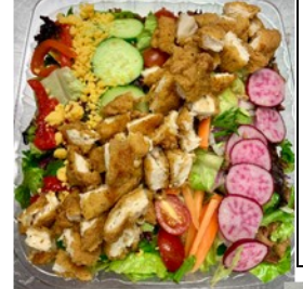
Breaded Fried Chicken