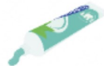
Dental Care Supplies