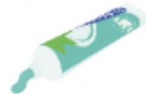
Dental Care Supplies