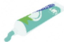
Dental Care Supplies