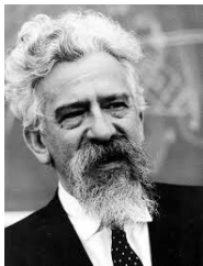
Abraham Joshua Heschel

There is a unique kind of transparence about things and events. The world is seen through, and no veil can conceal God completely. So the pious man is ever alert to see behind the appearance of things a trace of the divine, and thus his attitude toward life is one of expectant reverence.