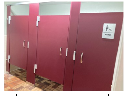
Ladies Room Partitions

In the last month we have been very busy with new projects, We installed new partitions in the ladies and men's room, new flooring inside the church and a new roof on the rectory.