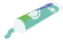
Dental Care Supplies