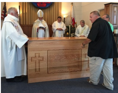
Side of Altar - Alpha & Omega- The 4 Gospels