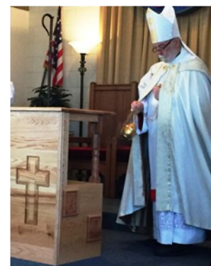
Bishop then blesses the altar with incense.