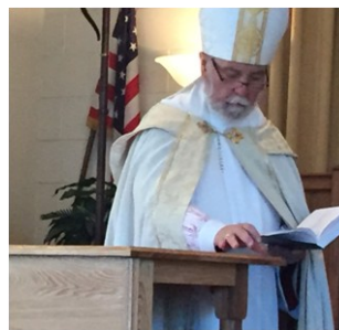
Bishop putting Holy oil on new altar in the middle of altar then on the four corners.