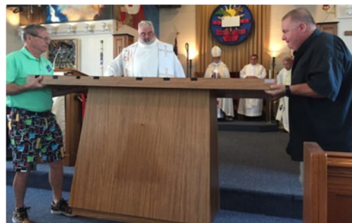
Moving the altar to make way for the new altar.