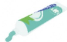
Dental Care Supplies