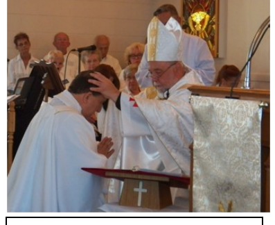
11-10-12 Ordination to the Priesthood