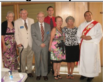
Confirmation Class of 2011