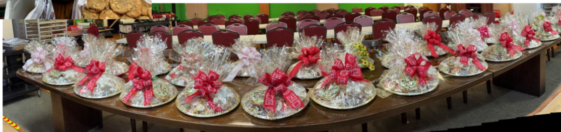
The finished trays of cookies.