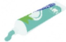
Dental Care Supplies