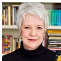
Sue Monk Kidd

Something deep in all of us yearns for God's beauty, and we can find it no matter where we are.