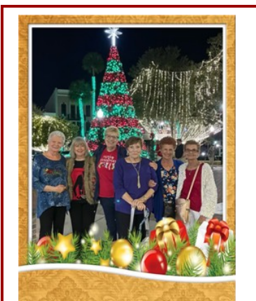
ANS Church Cleaning Crew out for dinner and to see the Christmas Lights on the Square in Ocala.