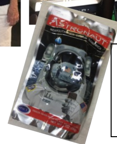
Space Ice Cream for dessert