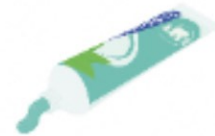
Dental Care Supplies