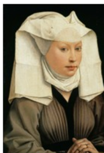
Julian of Norwich

The greatest honor we can give God is to live gladly because of the knowledge of His love.