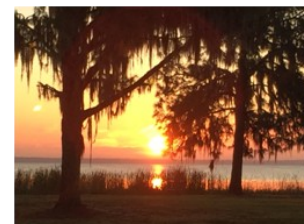
1-25-2020 Sunrise at Lake Yale Conference Center over Lake Yale.