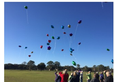
The prayer balloons are released.