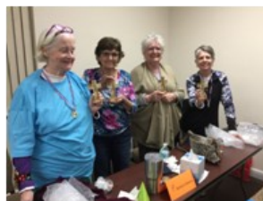
Scavenger Hunt winners.