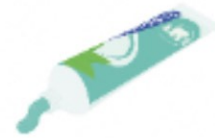
Dental Care Supplies