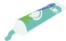
Dental Care Supplies