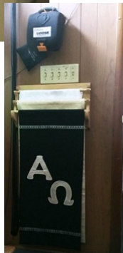
←--- New rod and shelf for Father Mark's stoles. Storage cabinet. Wooden rods for special lectern banners.