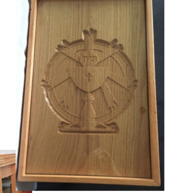
Side small table next to altar with a picture etched on top with glass on top of it.

Two new candle holders on the front side of the altar.