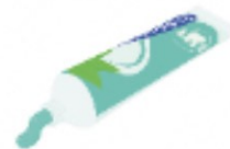
Dental Care Supplies