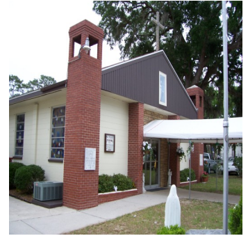
St. Paul Polish National Catholic Church