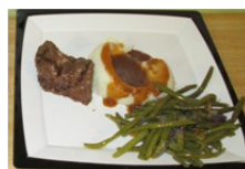
Beef Tenderloin, Mashed Potatoes with Gravy, Baby Green Beans were served.