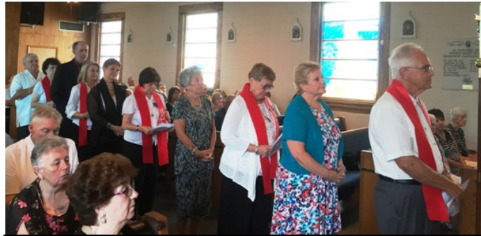
Confirmation Class with their sponsors.