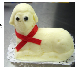
Our Easter Lamb Butter